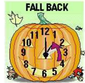
DAYLIGHT SAVINGS TIME ENDS

On Sunday, November 6th at 2:00 a.m., we will officially end Daylight Savings Time. Please set your clocks back one hour on Saturday night. At the same time, it is a good idea to change the batteries in your smoke detectors and carbon monoxide detectors.